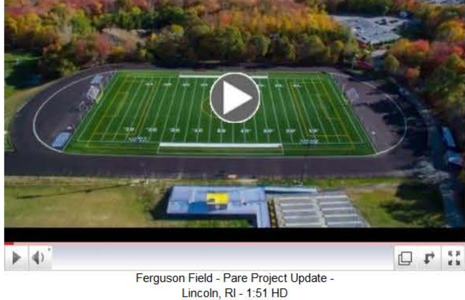
Ferguson Field - Pare Project Update - Lincoln, RI - 1:51 HD

Ferguson Field, Lincoln, RI: Pare Corporation and Birchwood Design Group provided the design of the redevelopment of the Ferguson Field athletic complex at Lincoln High School. This video captures the nearly finished project using the Inspire1 drone, as well as still images describing the field before, after, and during the ribbon-cutting ceremony. For a full project description, visit our YouTube channel .