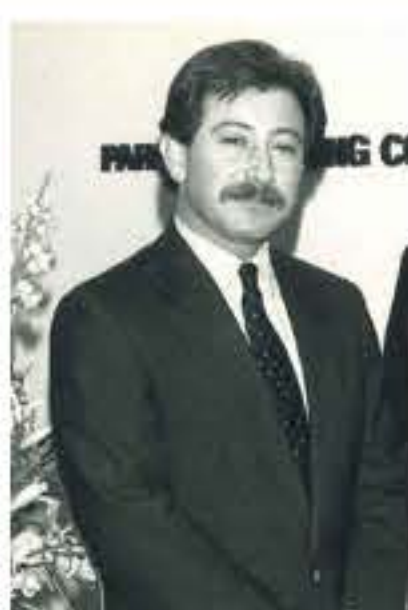
An early photo of our president